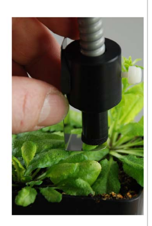
DUAL-BA in use -Closeup