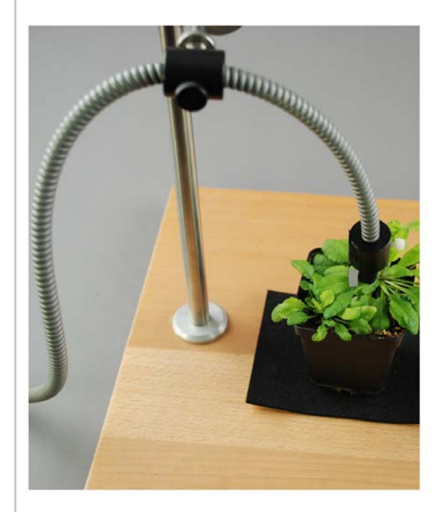
DUAL-BA in use -Overview